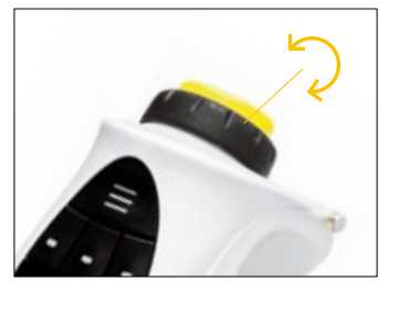
Adjustment Wheel Offers extremely fast volume setting and easy menu navigation. Enables ergonomic one-handed operation. Accurately control manual pipetting and titrating speed with just a light touch of the thumb.