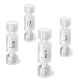
Fig. 1: Four types of Sartobind ^{\circ} Pico 0.08 mL are available. For the content of the package refer to chapter 7 Ordering Information.