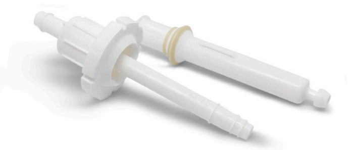
Gammasart ATD™ connector