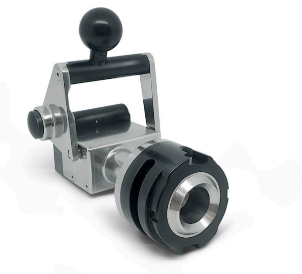
SART System™ internal port