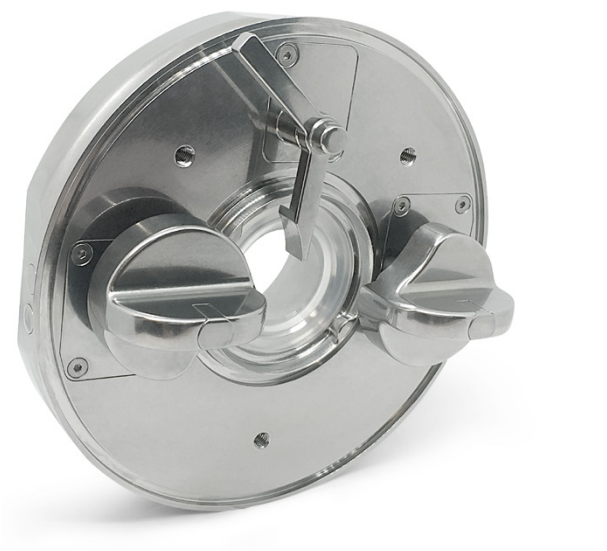
SART System™ external port