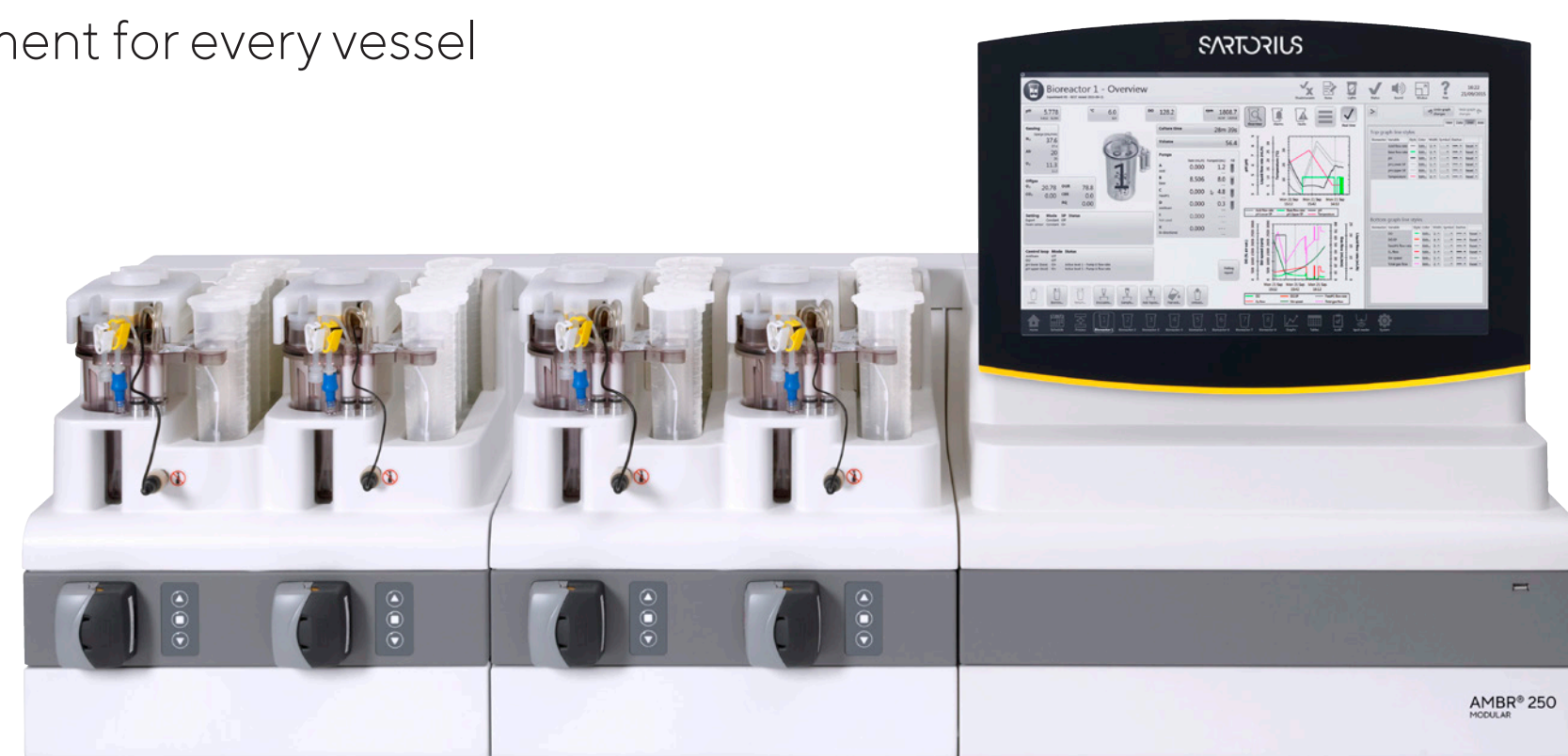
Figure 1. Ambr ® 250 Modular system