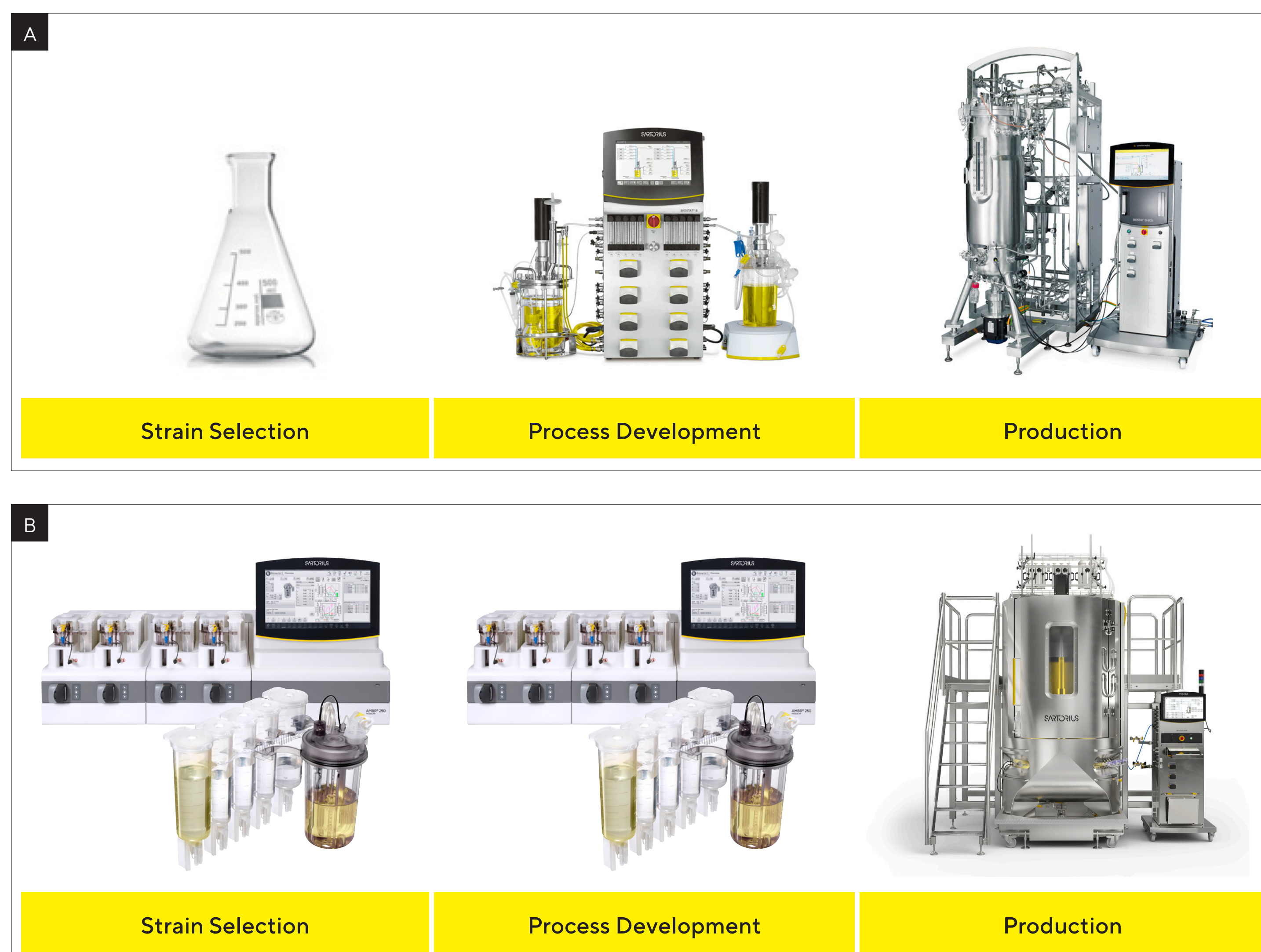
Figure 2. a) Traditional Process development approach with shake flasks, glass bioreactors (e.g. Univessel ® Glass) and stainless steel bioreactors (e.g. Biostat ® D-DCU) b) Single-Use Process development approach with the Ambr ® 250 Modular and the Biostat STR ® . The Ambr ® 250 Modular system can be used for both screening, and process development..

The fed-batch cultivation in the Ambr ® 250 Modular achieved after 28 h a final optical density (OD 600 ) of 335 and a final dry cell weight (DCW) of 120 g/L, which is comparable to the cell densities achieved in the Univessel ® Glass 5 L (Figure 3a.). A maximal OUR of 600 mmol/L/h was measured and in contrast to the k a value determined during process engineering characterization (Tab. 1), a process k i a value of 870 h -1 was calculated. The reason for the increased k a is the high response time of the pO 2 sensor in a buffer system compared to a cultivation. All other cultivation conditions were comparable within the two systems and were in the desired range. Consequently, even at high cell densities no limitations occurred, especially regarding oxygen transfer and heat generation (Figure 3b.).