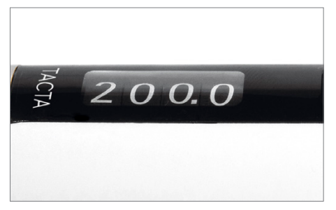
The volume is easy to read even when the pipette is angled.

The large, easy-to-read display helps you to see all four digits of the set volume from a distance without straining your eyes. The volume is easy to read even when the pipette is angled – eliminating the need to turn your head into an uncomfortable position.