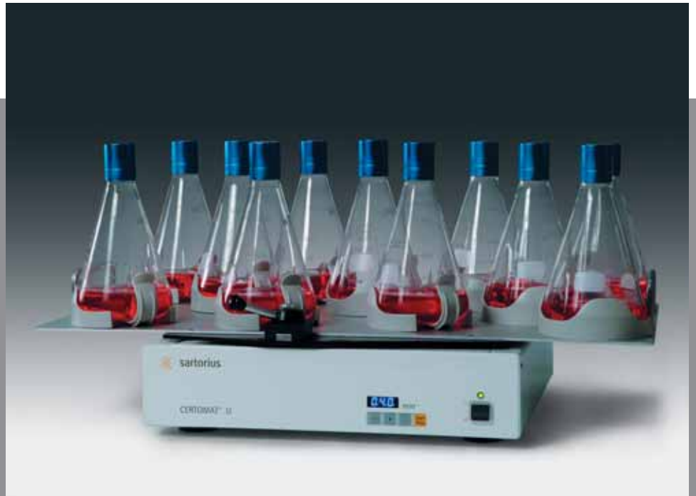
CERTOMAT ® U Orbital and linear benchtop shaker with magnetic drive