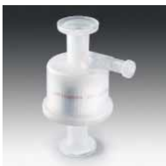
Sartobran 150 (type SS)